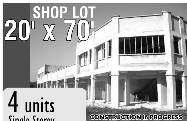
CONSTRUCTION in PROGRESS

4 units Single Storey FROM RM 148,880 & ABOVE