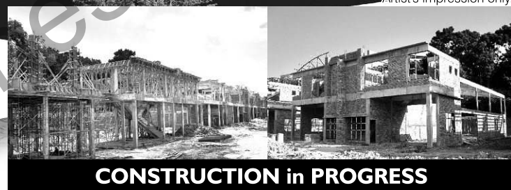
CONSTRUCTION in PROGRESS