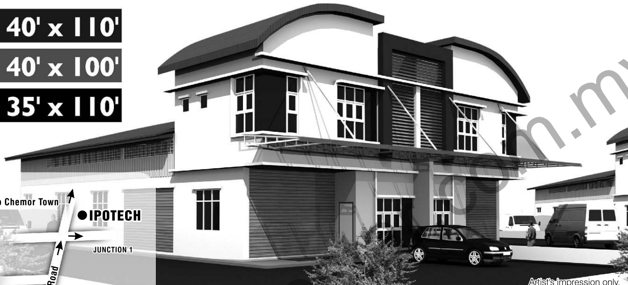
Artist's impression only.